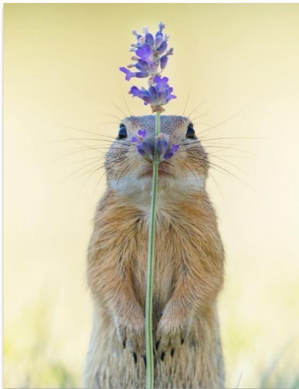
Ascension? I thought you said Attention